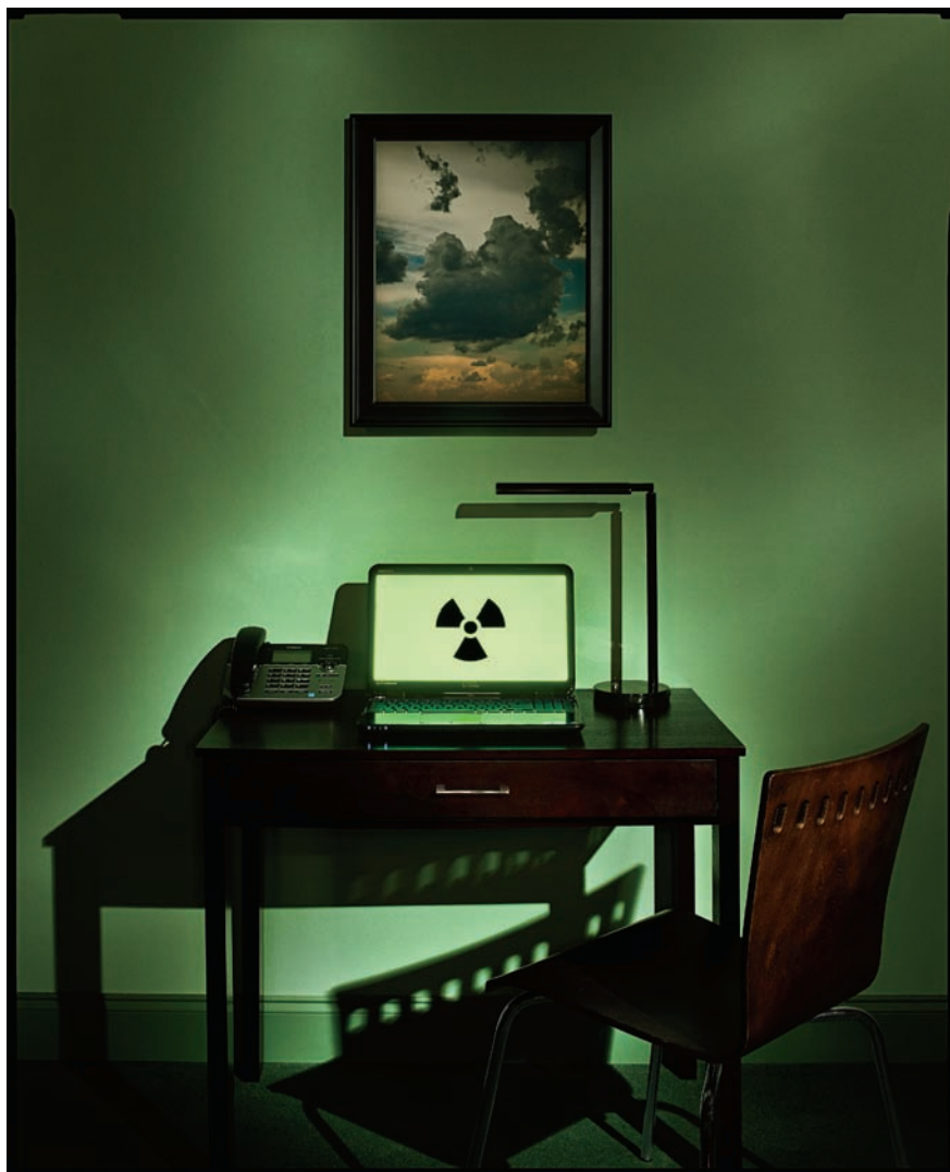
The Mossad extracted evidence of the nuclear site from the computer of a Syrian official.

The briefings on Balfour Street began with Israel's former Prime Ministers, including Shimon Peres, Ehud Barak, and Netanyahu, Olmert's political rival. The