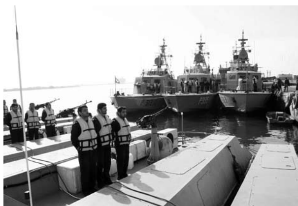
Fig. 5. Tondar fast-attack craft.

equipped with lightweight 324-millimeter short-range (6–10 km) torpedoes.