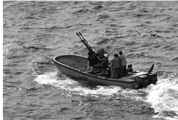
Fig. 3. An Ashura-class small boat fitted with a ZU-23-2 cannon.

Although the most numerous vessel in the IRGCN arsenal is the fiberglass Ashura motorboat (see fig. 3)—which may carry a heavy machine gun, a multiple rocket launcher (MRL), or a single contact mine—it also uses several of the other small boats procured or produced by Iran. These include the Tareq (the Swedish Boghammer speedboat); 1 the Zolghadr, Zoljaneh, or Bahman catamaran patrol boats, which are capable of carrying both torpedoes and rocket launchers and may also be used for covert mining missions in Persian Gulf shipping lanes; and the Zolfaghar and Azarakhsh FACs (versions of the China Cat built in Iran), which are capable of carrying a sixteen-tube HM 23 122-millimeter naval MRL (with a range of