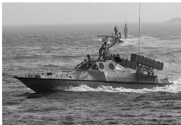
Fig. 4. An IPS-16 torpedo boat fitted with Kosar anti-ship-missile launchers.