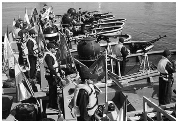
Fig. 8. Ashura-class small boats configured for mine-laying duties.

The difficult-to-detect bottom mines are suitable for waters no deeper than 180 feet (60 m), while moored mines are used in deeper waters, although currents at the Strait of Hormuz are strong enough to displace all but firmly moored mines. 12 The maximum depth of the strait is 264 feet (80 m), and in the Persian Gulf it is between 260 and 330 feet (80–100 m), although most shipping corridors there are no deeper than 115 feet (35 m).