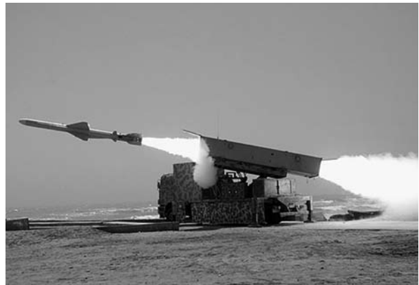
Fig. 7. A C-802 coastal anti-ship-missile battery.

Next in line is the Noor anti-ship cruise missile—a license-produced, upgraded version of the