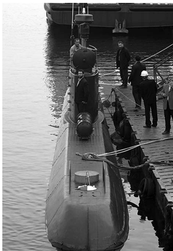
Fig. 6. A Ghadir-class midget submarine.

Even innocent-looking merchant ships or trawlers can have hatches below the waterline and facilities for delivering and recovering small submersibles. 9 Such an arrangement would be ideal for long-range “strategic” operations in the Gulf of Oman and the Arabian Sea, similar to those carried out by the Italian Navy in the Mediterranean during World War II.