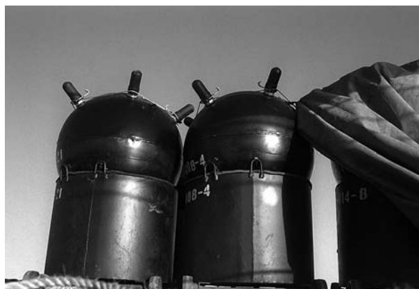
Fig. 9. Iranian M-08 contact mines.

The IRGCN could task small speedboats, submarines, and nondescript civilian vessels manned by military crews to covertly mine shipping corridors and harbor entrances, while combat divers inserted by IRGCN or IRIN Zodiac boats and wet submersibles, or dropped by helicopter, could attach limpet mines to enemy ships or offshore oil facilities.