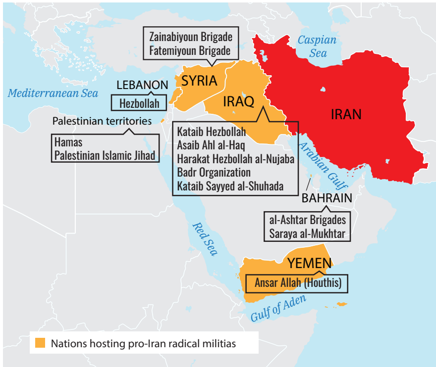
Figure 1. Iran and Its Proxies

Beirut, Damascus, Baghdad, and Sanaa. In all these places, it has exploited civil wars and interstate conflicts to deepen its political, economic, and military influence.