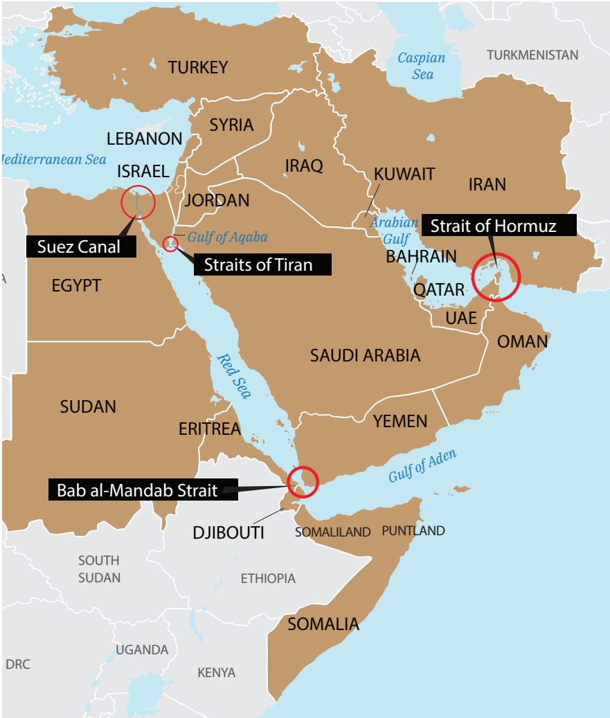
Figure 4. Bab al-Mandab Strait and Arabian Gulf