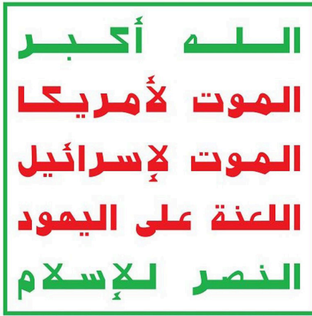
Figure 3. Houthi Slogan

In translation, the Houthi slogan reads, "Allah/God is greatest, death to America, death to Israel, curse the Jews, victory to Islam."