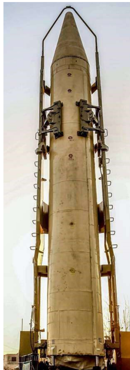
A side-by-side comparison of the Khoramshahr-1 and 4 engineering prototypes shows modifications in areas like erector arms, reentry vehicle skirt area, missile-launchpad attachment points, and what appear to be added stabilizing fairings to the newer version.