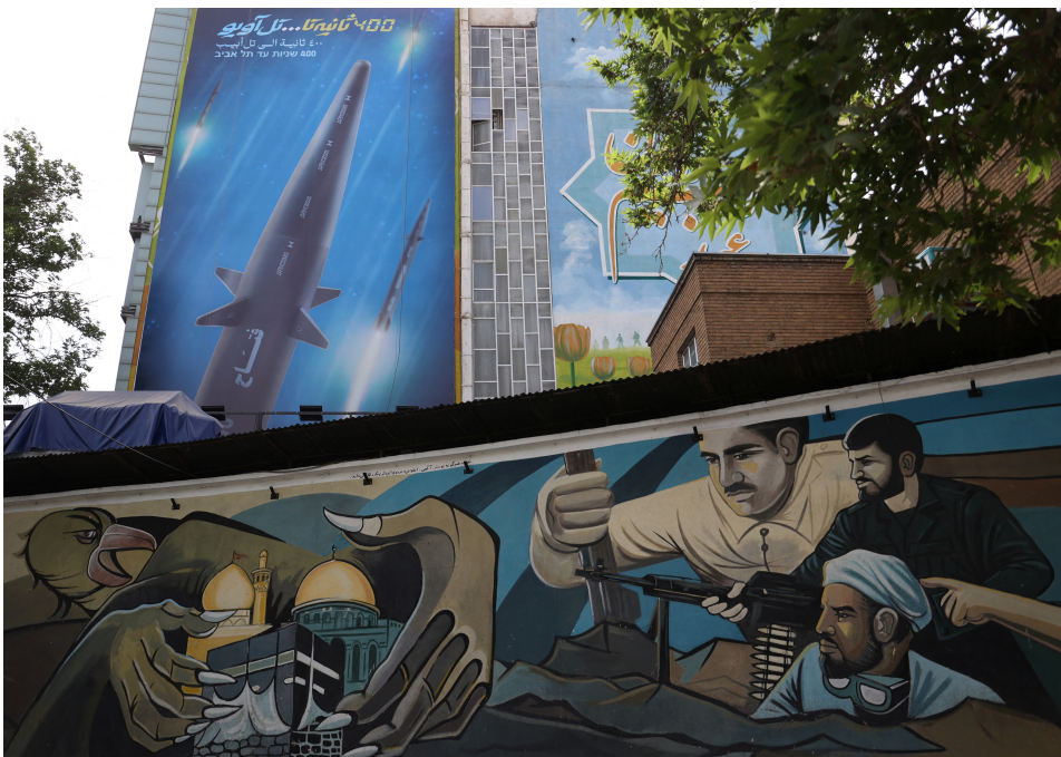
A billboard with a photo of the new “hypersonic” missile known as Fattah appears on a Tehran building with text reading, “400 seconds to Tel Aviv,” June 8, 2023.

If one takes at face value the capabilities Iran claims for its hypersonic missile, then the Fattah, in its current configuration, could be seen to occupy its own subclass. This is because, while it evidently still cannot conduct significant, sustained atmospheric maneuvers besides minor course corrections, the relatively large solid-fuel rocket motor with thrust vectoring in its WH/RV section can allow significant maneuvers outside the atmosphere. Separately, although a short video released on unveiling day attempted to indicate a successful test-firing, the video most likely showed a previous test for a similarly sized Kheibar Shekan missile, which suggests the Fattah might still be some time from its first live test and possibly several years from becoming operational. This could give more time to defense companies like Northrop Grumman and Rafael to hone their anti-hypersonic technology.