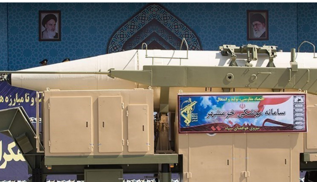
The Khoramshahr-1 debuts at a September 22, 2017, military parade in Tehran.