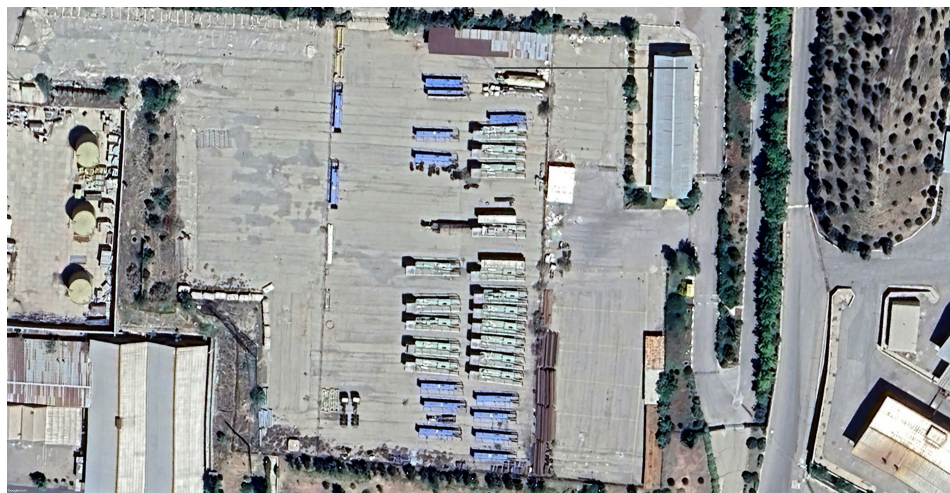
Satellite imagery of east Tehran’s Hakimiyeh missile industrial complex from spring 2023 shows at least fourteen completed Khoramshahr TELs (in blue) apparently awaiting delivery.

The question thus arises of what can be done to limit the risks of these growing Iranian capabilities alongside its perceived march toward a nuclear weapon capability. Already, the United States, several European countries, and Israel have been developing high-tech anti-hypersonic missile detectors and interceptors, but these efforts need to be given higher priority and be better integrated across national boundaries. Furthermore, Washington especially—by fielding a credible long-range conventional precision-strike capability in the region that incorporates hypersonic speeds and maneuverability, along with optional hardened-target penetration—could help discourage an increasingly emboldened Tehran. The U.S. Army’s land-mobile Long-Range Hypersonic Weapon (LRHW), a ground-launched boost-glide missile system with a range of about 2,800 km, will soon enter operational service, and while the Indo-Pacific is often considered the theater of choice for deployment of such advanced systems, the Middle East should also be considered for any early deployment. This way, the United States could reassure Iran’s neighbors and demonstrate its ability to quickly strike any number of military targets throughout Iran and the region with confidence and impunity. ❖