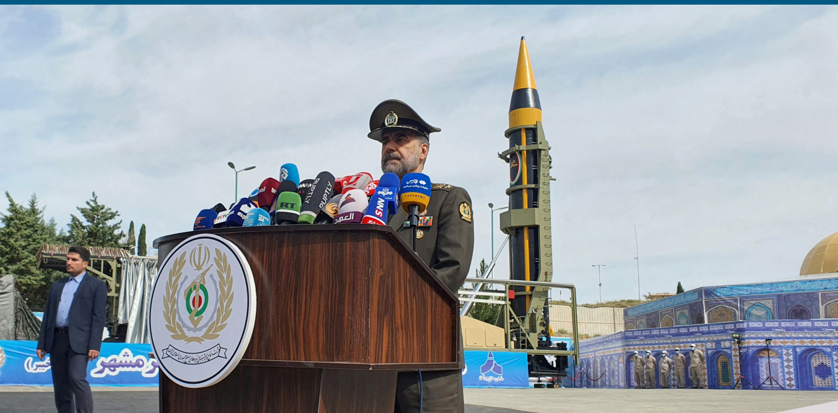
Iran's defense minister, Gen. Mohammad Reza Qaraei Ashtiani, introduces the latest Khoramshahr ballistic missile in Tehran.

O n May 25, 2023, Iran's minister of defense, Gen. Mohammad Reza Qaraei Ashtiani, unveiled the so-called fourth generation of the Khoramshahr liquid-fuel ballistic missile—aka Kheibar—amid heightened tensions with Israel and the West regarding Tehran's nuclear program and renewed talk of preventive strikes against Iran's key nuclear sites. Ashtiani spoke at the Hakimiyyeh Aerospace Industries Organization complex, east of Tehran, against a backdrop with the new missile and a large model of Jerusalem's Dome of the Rock.