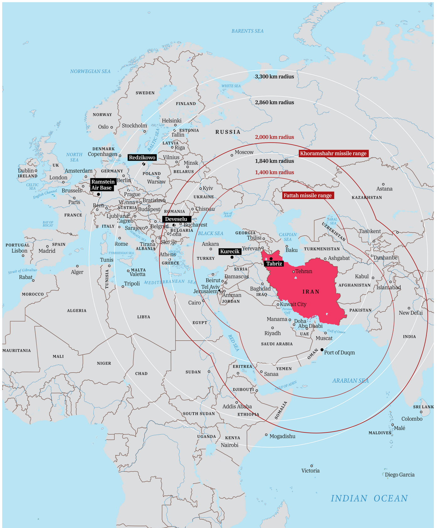
Map showing reported maximum range of Iran's Khoramshahr and Fattah ballistic missiles, and comparative distances from Europe's Aegis Ashore missile defense facilities.