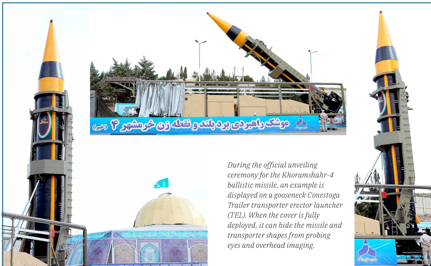
During the official unveiling ceremony for the Khoramshahr-4 ballistic missile, an example is displayed on a gooseneck Conestoga Trailer transporter erector launcher (TEL). When the cover is fully deployed, it can hide the missile and transporter shapes from probing eyes and overhead imaging.