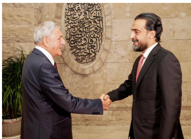
Iraqi president Abdul Latif Rashid meets with then parliament speaker Mohammed al-Halbousi on July 4, 2023.

Ascendant since have been wealthy businessman Khanjar and Halbousi. Of late, the two leaders have joined forces under the Siyada (Sovereignty) alliance, but their frequent sparring over power and perks has been serious enough to necessitate Turkish mediation. 57 The impressive rise of Halbousi, still in his early forties, epitomizes the current family-personalist trend in Iraq. He embraces no particular ideology and has not voiced opposition to Baathism. For his part, Khanjar was already a tribal sheikh and businessman before entering politics. The rise of Khanjar and Halbousi has shifted the Sunni center of gravity to Anbar, home to both, and time will tell if they stay resilient—especially since Sunni leaders who lack armed militias must rely primarily on elections and coalitions with Shia and Kurds. 58