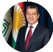
Masrour Barzani (b. 1969) son of Masoud KRG prime minister and second vice president

son of Mustafa KDP leader since 1979 KRG president, 2005–17