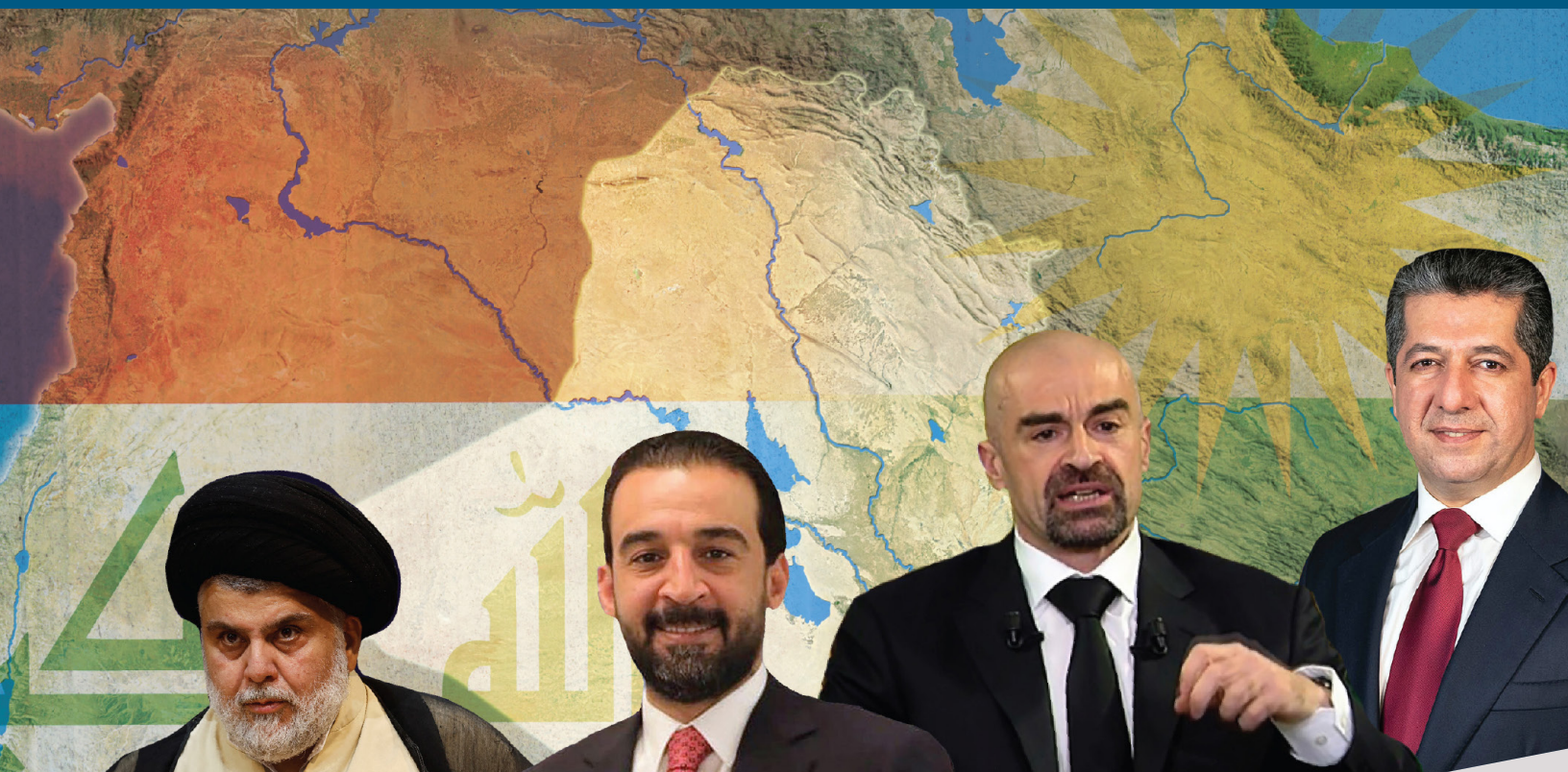
Composite image of Iraqi power players (left to right): Muqtada al-Sadr, Mohammed al-Halbousi, Bafel Talabani, and Masrour Barzani.

A fter the fall of Saddam Hussein's dictatorship in 2003, Iraqi political parties proliferated in an indication of enthusiasm for the country's emerging democracy.* But that enthusiasm has been coopted in recent years by a handful of personalities and families, who have commandeered parties to advance their own power and interests. Political families and charismatic leaders are no doubt common in the Middle East, and factors contributing to their rise in Iraq include the tribal structure of society, an oil-dependent economy, state weakness resulting from decades of conflict and sanctions, and interference from neighboring countries.