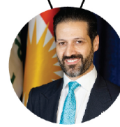
Qubad Talabani (b. 1977)