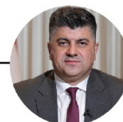
Lahur Talabani (b. 1975)