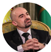
Bafel Talabani (b. 1973)