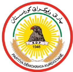
Kurdistan Democratic Party (KDP) Founded in 1946