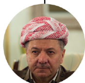
Masoud Barzani (b. 1945)

son of Mustafa KDP leader since 1979 KRG president, 2005–17