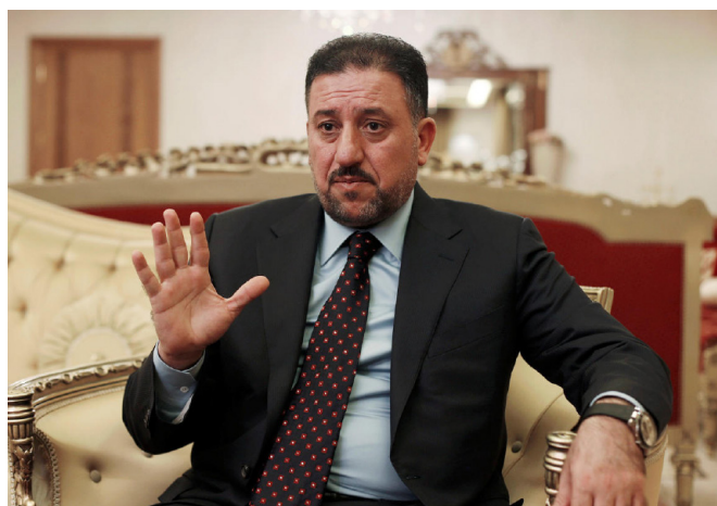
The Sunni political leader Khamis al-Khanjar, a member of the Siyada alliance, is under U.S. sanctions for corrupt practices.

border, is different from Diyala, which has a mixed Sunni-Shia population and borders Iran. Competition for influence likewise pits the Sunni elites of Anbar against those of Mosul, Iraq's largest Sunni-majority city. Before the Islamic State seized Mosul in 2014, the city was dominated by the wealthy, landowning al-Nujaifi family. But the family lost most of its seats in the 2021 elections amid factors such as the rise of IS and corruption. 55 Now it must answer to the Barzani clan and the militias that uphold the city's security. Another prominent Sunni figure, Salim al-Jabouri, the former speaker of the Iraqi parliament, disappeared from the political scene amid his alleged ties to Iran and clashes with Khalid al-Obeidi, a rising Sunni leader from Mosul who previously served as defense minister. 56