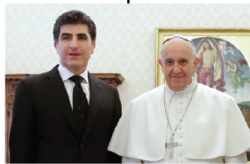
Nechirvan Barzani (b. 1966) cousin of Masrour KRG president and KPD vice president