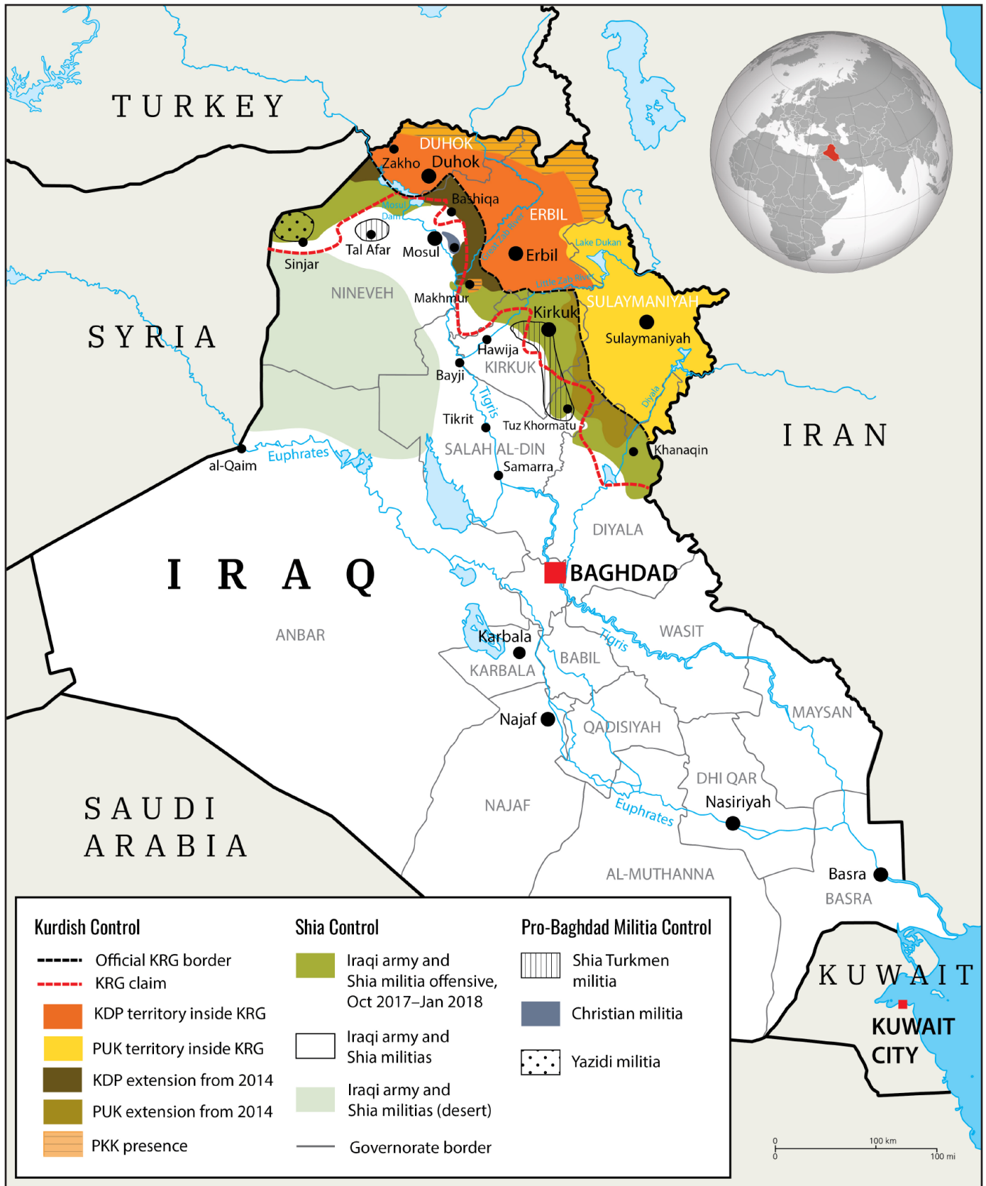
Map 1. Iraq and the Kurdistan Region